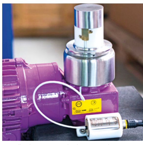
Two Hall probes are integrated in the tiny sensor housing

"In order to determine mixing capacity, the information we need includes the speed of the mixing head," explains AWH product manager Anja Hauffe. This is