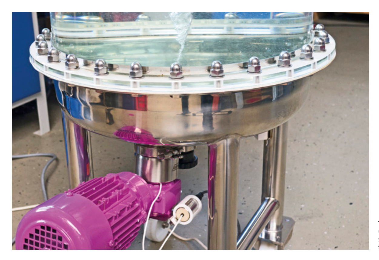
The new analog modules are particularly flexible for the different types of input signal