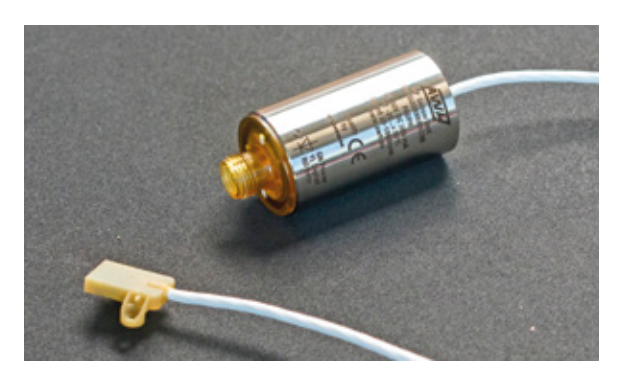
Thanks to the shape and fully potted design, the electronics of the small sensor unit is always correctly seated

ly at a specific angle to the magnetic fields. This is firstly ensured by the potting, and secondly through the special design of the sensor unit, which can only be inserted correctly in the groove of the mixing head support. This design also prevents the sensor from moving. With other manufacturers, the position of the sensors is not fixed and can move through vibration, which then causes incorrect signals and malfunctions.