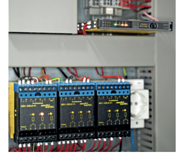
Simple retrofitting of control cabinets: The low installation and commissioning costs of the IM12-CCM convinced the specialists of e-netz Südhessen AG

If the temperature exceeds 42 ^{\circ} C, the cabinet guard sends a signal to the PLC. Nagel has programmed this limit value into the IM12-CCM via an IO-Link USB adaptor.