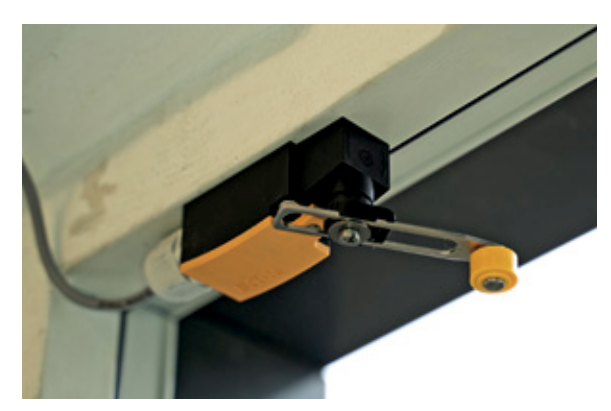
Insecure door contacts or roller switches that were costly to install were not considered for retrofitting the cabinet guarding system

Alternatively, the parameterization could have been carried out via FDT software such as PACTware or directly on the device using quick-teach. e-netz Südhessen also benefits from the internal data logger of the 12.5-mm-wide cabinet guard, which provides values with a time stamp and stores them for up to two years. This allows technicians to track the conditions under which abnormal temperature values have occurred at any time.