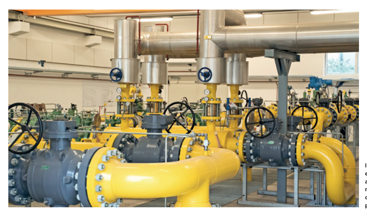
In the transfer station, e-netz Südhessen AG adapts the supplied natural gas to the conditions of the local pipelines

measuring stations," said Jürgen Nagel, who is responsible for the electrical system in the gas and water supply plants of e-netz Südhessen. When was a control cabinet door opened at which location? This information is expected to reach the control center without the need for complex electrotechnical expansions in the decentralized stations.